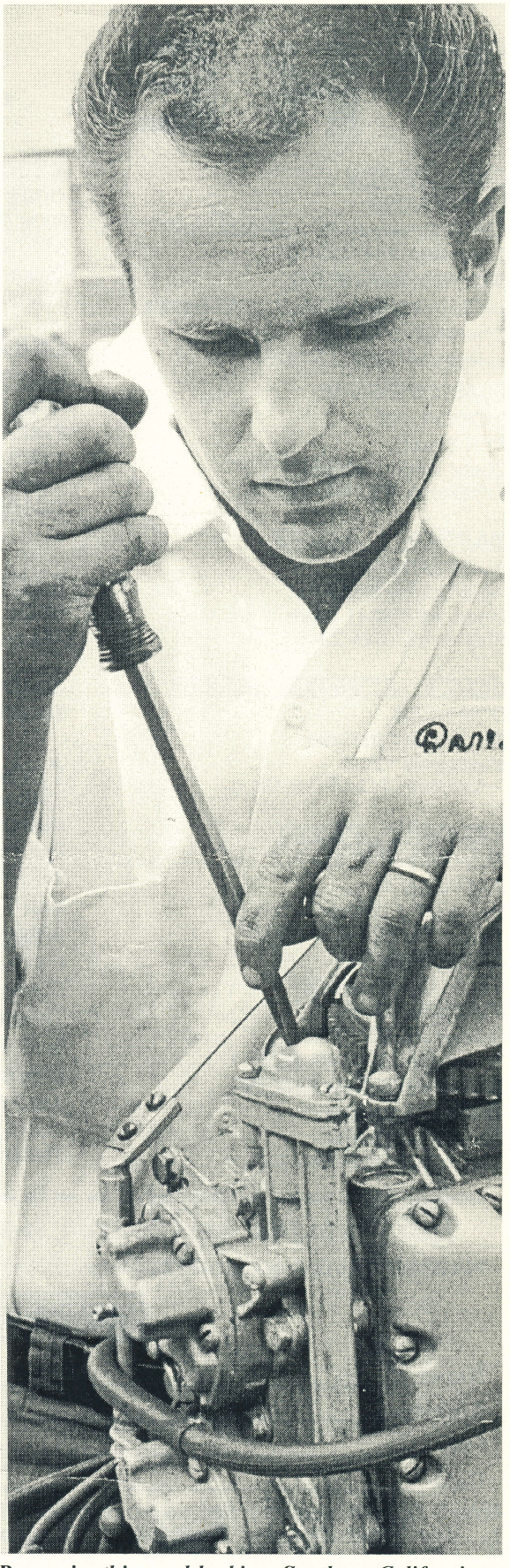
Recognize this good-looking, Southern California Chapter Member? Picture is from 1960 when he was a Serviceman at Harrison's Boat Center. See up-todate, exact pose, 2001, picture in next Newsletter.